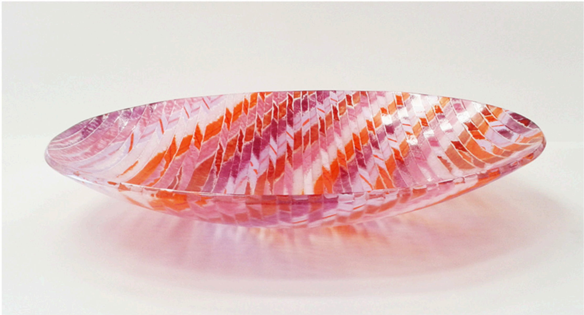
Woven in Light